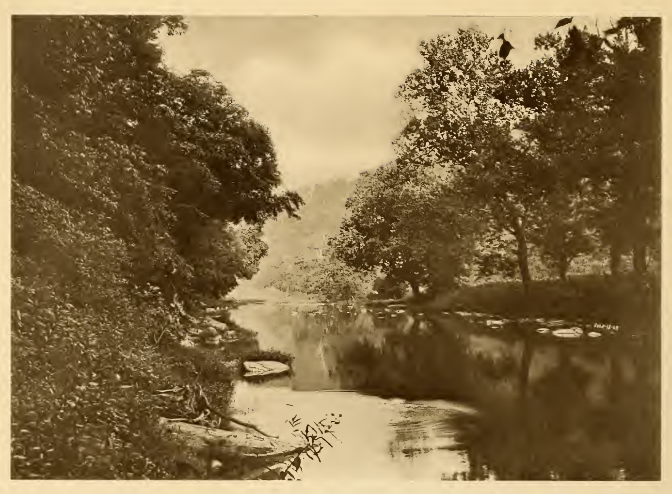
A SCENE ON BUFFALO CREEK, NEAR THE MILLIDAM