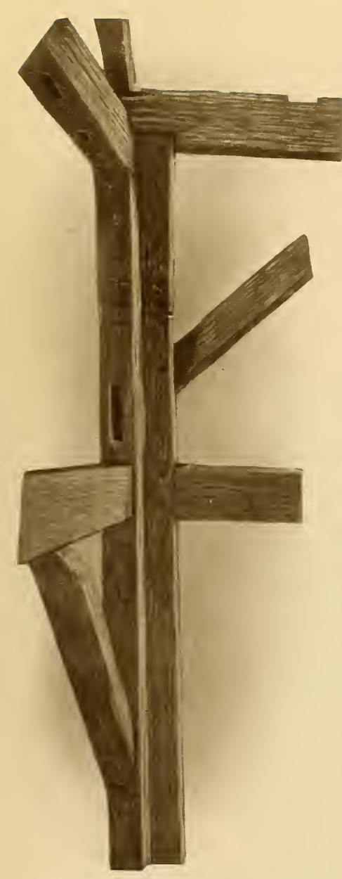
A CORNER TIMBER OF THE OLD CHURCH

So poor were most of the members that they were unable to finish the interior of this modest frame building, and assembled in it for worship even during the inclemency of the winter, without stoves or other means of comfort. But the chill and cheerlessness of their surroundings found compensation in the ardor of their devotion and the warmth of their affection, which had been elevated above the love of party by the love of Christ. In 1844, after several years of disuse, the old church building was moved to the village of West Middletown, a distance of about four and a half miles, and was used as a blacksmith shop, store, postoffice, and for other purposes until now it is back of the main street and the property of a colored man.