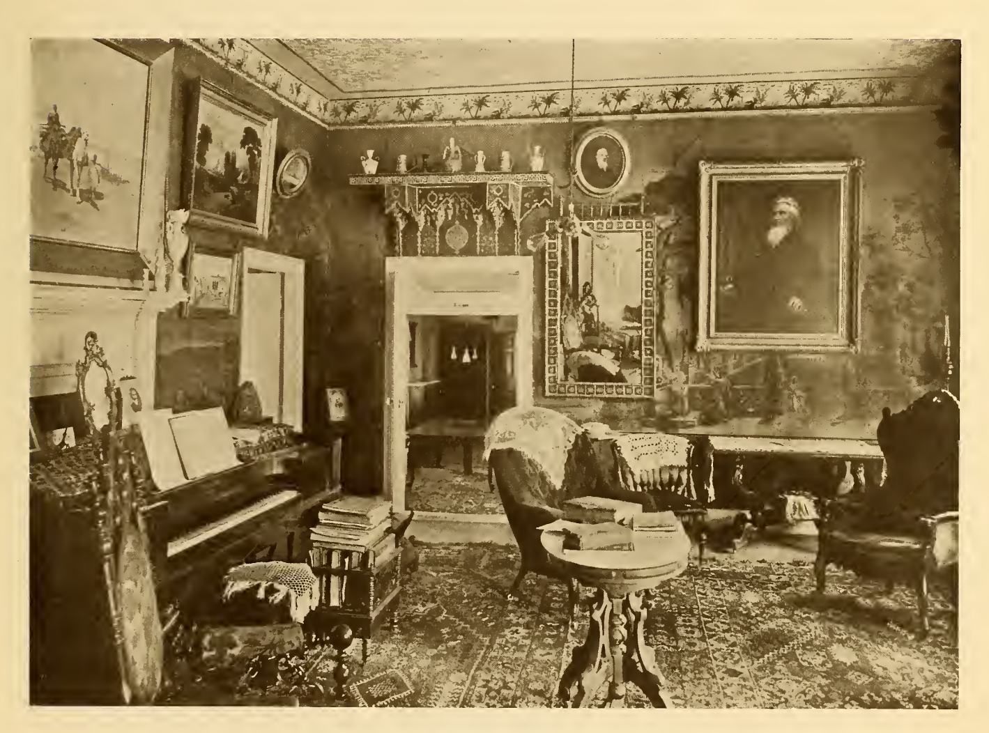
THE NEW PARLOR

During the year 1819, the big part of the home as you now see it was erected for the purpose of accommodating students and friends. It was called Buffalo Seminary then, and in years became Bethany, and it is the location of Bethany's first postoffice.