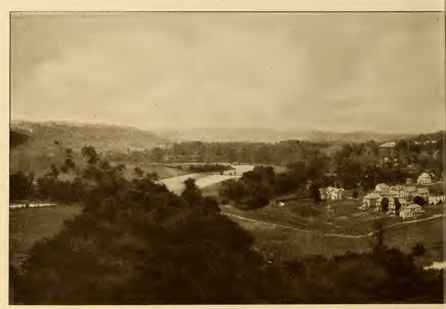
1909 VIEW OF BETHANY