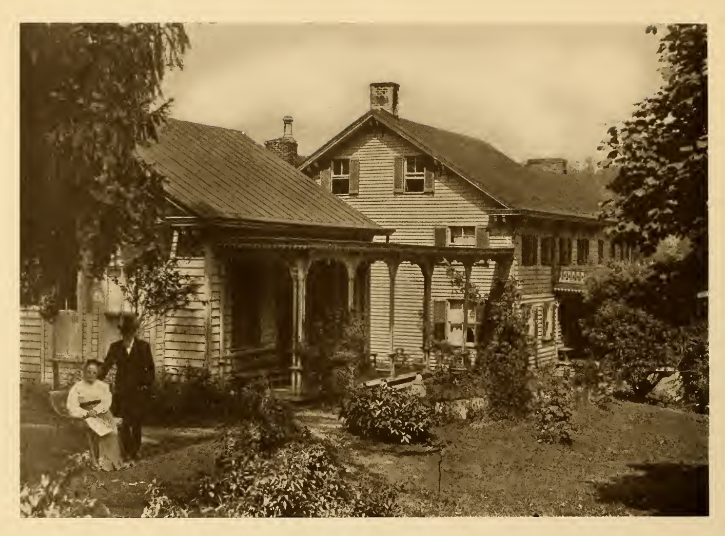
THE CAMPBELL HOMESTEAD

This venerable pile of buildings, old and new, was the home of the stranger and visitor in days gone by, more than any other spot in all this region — indeed there were few spots in all the world like it. People came here from far distant points, even Europe, not to stay a day or two, nor even a week, but for weeks and months, thus keeping the capacious old edifice occupied to its limits, and all this without money and without price; and this has been the spirit of the old home in which some members of the Campbell family have lived since 1811. The old portion of the house is entirely covered over with the newer parts, but is still in a good state of preservation. The foundation is excellent, and the weather-boarding of oak is sound; all else is the same as when built.