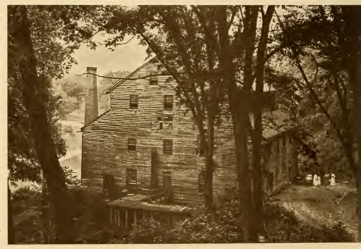
THE OLD MILL ALONG BETHANY PIKE