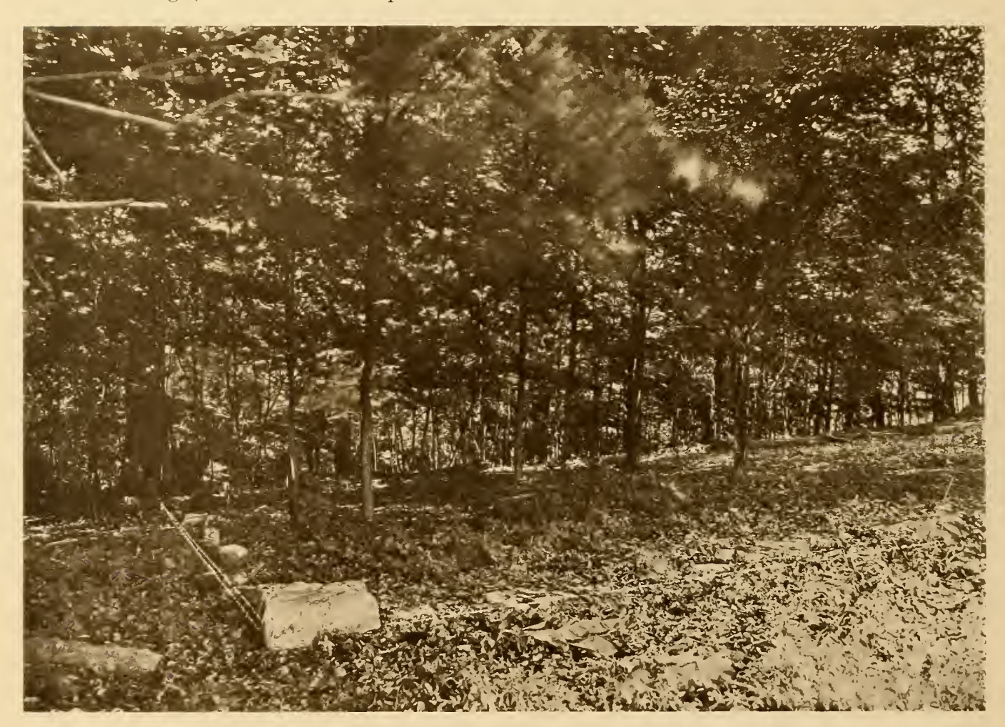
VIEW OF THE GROUNDS WHERE THE FIRST CHRISTIAN CHURCH WAS ERECTED

Where the building stood is now entirely grown over with a small growth of trees and, but for a few visible blocks of limestone appearing mysteriously in regular lines, forming a rectangle, the location of this place would be difficult.