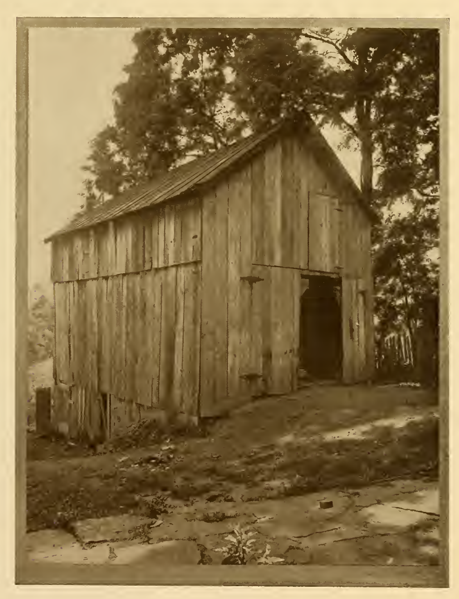
This frame building, now situated in the village of West Middletown, is the only relic of Old Brush Run Church.

So poor were most of the members that they were unable to finish the interior of this modest frame building, and assembled in it for worship even during the inclemency of the winter, without stoves or other means of comfort. But the chill and cheerlessness of their surroundings found compensation in the ardor of their devotion and the warmth of their affection, which had been elevated above the love of party by the love of Christ. In 1844, after several years of disuse, the old church building was moved to the village of West Middletown, a distance of about four and a half miles, and was used as a blacksmith shop, store, postoffice, and for other purposes until now it is back of the main street and the property of a colored man.